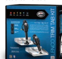
Retail Box See check-list below