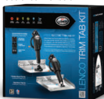
Retail Box See check-list below