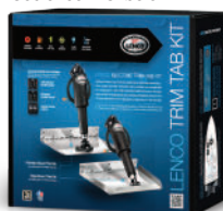
Retail Box See check-list below