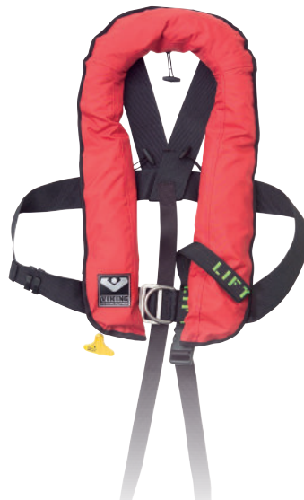
RescYou™ Conquest (PV9273)