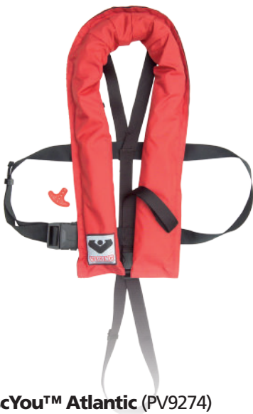
RescYou™ Atlantic (PV9274)

Your safety is our bottom line. All lifejackets inflate in a matter of seconds, are self-righting and designed with essential safety features such as crotch strap, SOLAS-grade retro reflective tape and a highly visible lifting becket. In a rescue situation every detail counts.